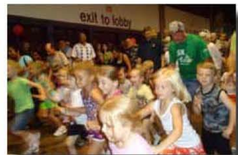
Children's Fun Run

The CDR Children's Fun Run is 6:30 p.m. Friday, Aug. 31. Participation in the event, for children ages 4-12 years, is free. An advance mail-in registration form is available at www.charlestdistancerun.com . Registration also is being offered the day of the event from 4:30 p.m. to 6 p.m. in the lobby of the Charleston Civic Center. Races begin on Clendenin Street between Quarrier and Lee streets across from the entrance of the Charleston Town Center.